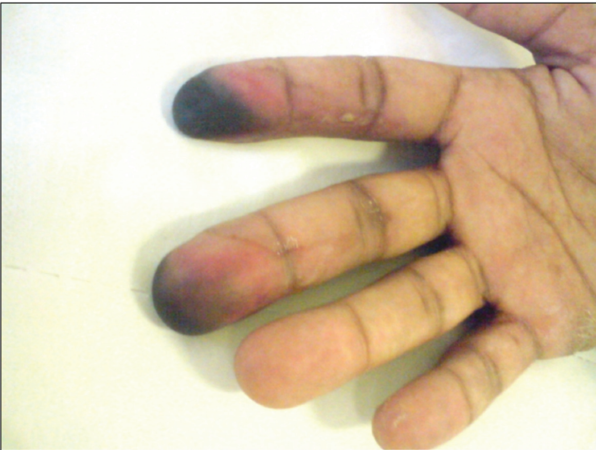
Dossier 8 – Question 14